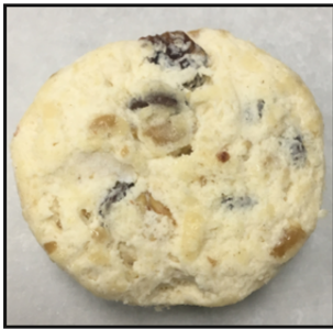
Unbaked - As Distributed

Food Name: Chocolate Chip Toffee Crunch Gourmet Frozen Cookie Dough Finished Foods: Chocolate Chip Toffee Crunch Gourmet Cookies Brand / Customer: Otis Spunkmeyer Sub Brand: Sweet Discovery